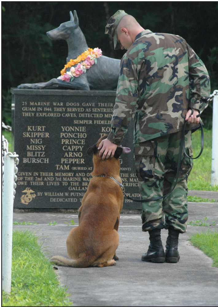
A U.S. Navy dog handler and his canine companion stand in respect at the War Dog Memorial on Guam Island.