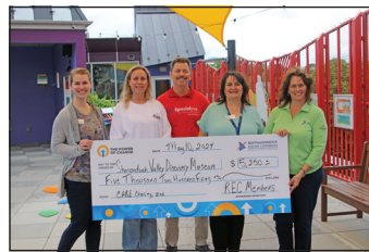
REC presents The Power of Change check to the Shenandoah Valley Discovery Museum.

For information, visit nsvmga.org or facebook.com/NSVMGA/