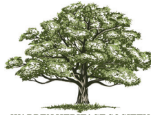
WARREN HERITAGE SOCIETY

from the Blue Ridge Mountains to the tidal waters of the Chesapeake Bay. For more information about REC, please visit www.myrec.coop . Follow REC on Facebook, X, Instagram, LinkedIn and YouTube.